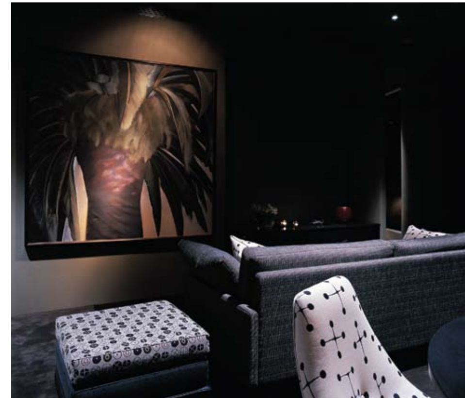
Craig's client requested that the design be based on 'cocktail hour in the city'

“With the Opera House in full view of the apartment, the location was a dream, and the whole process had no hiccups at all – except that I couldn't live there myself!”