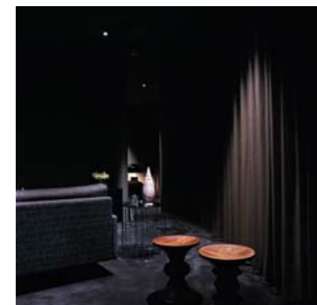
Free flow curtains were used to add drama