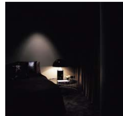
Dark paint colours were used throughout

Are you a designer or a home owner with a recently renovated property? Please contact the Sydney Home editorial department at editor@sydneyhome.com.au